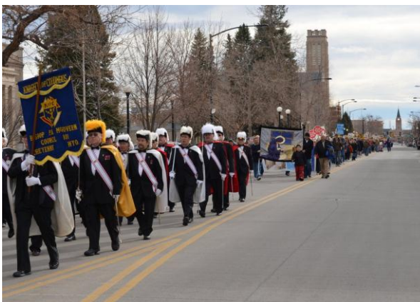
Marchers for life, led by Knights of Columbus 4 th degree Sir Knights, extend the length of Capital Avenue in Cheyenne.