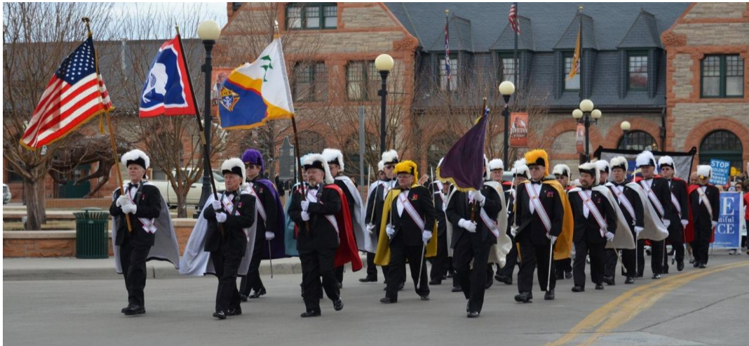
Knights of Columbus from Assemblies throughout Wyoming lead the March for Life up Capitol Avenue at Cheyenne on January 21 th. Additional photos on page 3