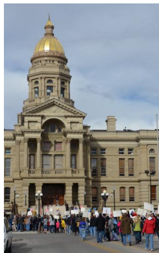
Marchers for Life arrive and gather at the Wyoming State Capitol during the March for Life held on a balmy Saturday in January 21 st .