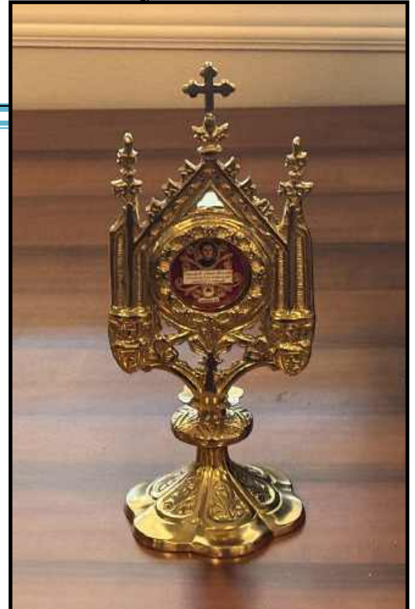
First Class Relic of Blessed Father McGivney that toured the State of Wyoming in March 2025