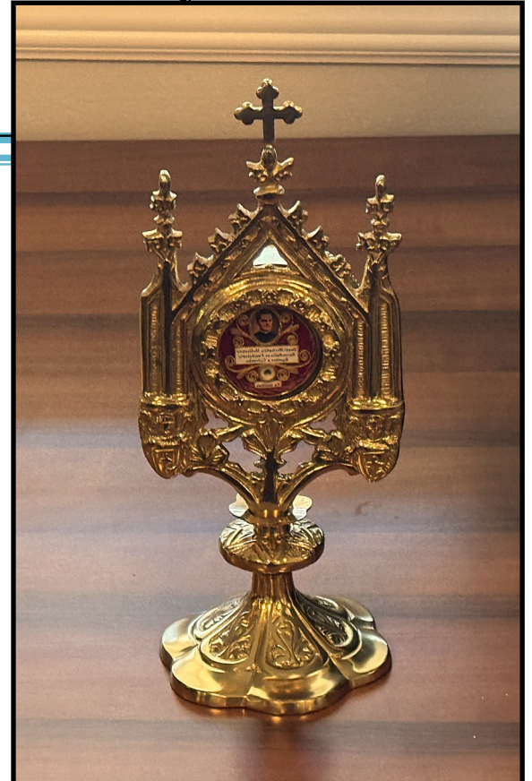
First Class Relic of Blessed Father McGivney that toured the State of Wyoming in March 2025